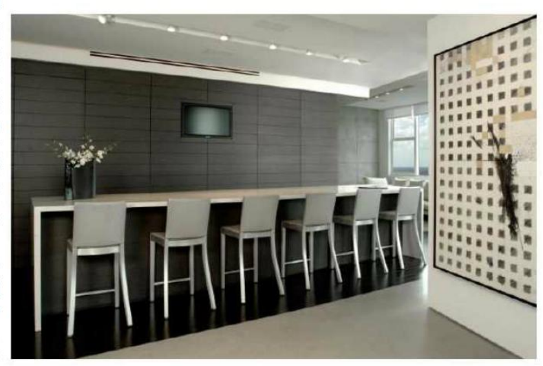
SPACESAVER: This bar in a Boca Raton condo is next to a wall that hides storage and a door to the kitchen.

"He was able to understand the construction of my unit and impact how we furnished it. One of the things that is really nice is the design is comfortable as well as being cool."